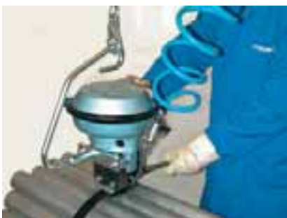
KPR, Maxi, PR 33 and SPZ HR 32 and HHA

Distributed By: Allstrap 1719 Kenny Rd Columbus, OH, 43212